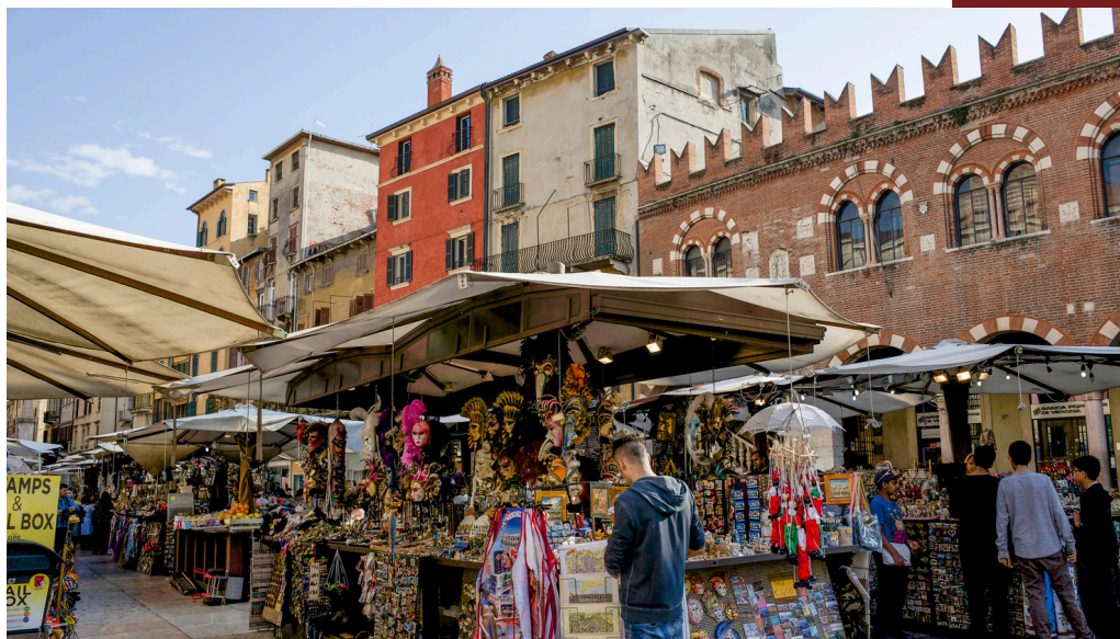
Byward Market, Downtown Ottawa